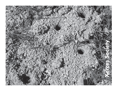
Each nest entrance hole (above) is reigned over by a single female Andrena (digger) bee. Where soil conditions are right, these bees may nest together by the thousands.