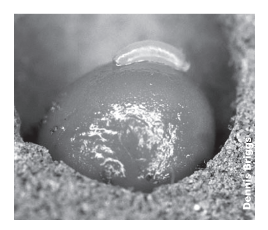
The young of both social and solitary bees eat protein-rich pollen balls moistened with nectar.