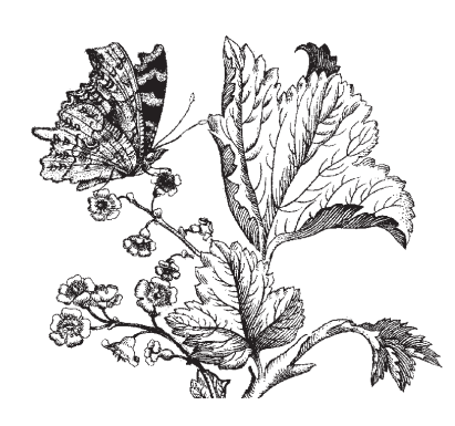
Plants in the rose family support a variety of butterflies and bees.

By reconsidering the "clean" farm strategy—a modern concept that creates a sterile, factory-like farming environment—unsightly "weeds," shaggy shrubs, and dead trees become a beautiful smorgasbord of floral food sources and highly sought-after nesting havens for native pollinators. Creating habitat in and around crops, conserving natural areas on the farm, and working with community members to protect and restore areas of high conservation value in the surrounding region will establish a complex functioning ecosystem. Embedding agriculture in systems that mimic wild Nature will offer long-term security. §