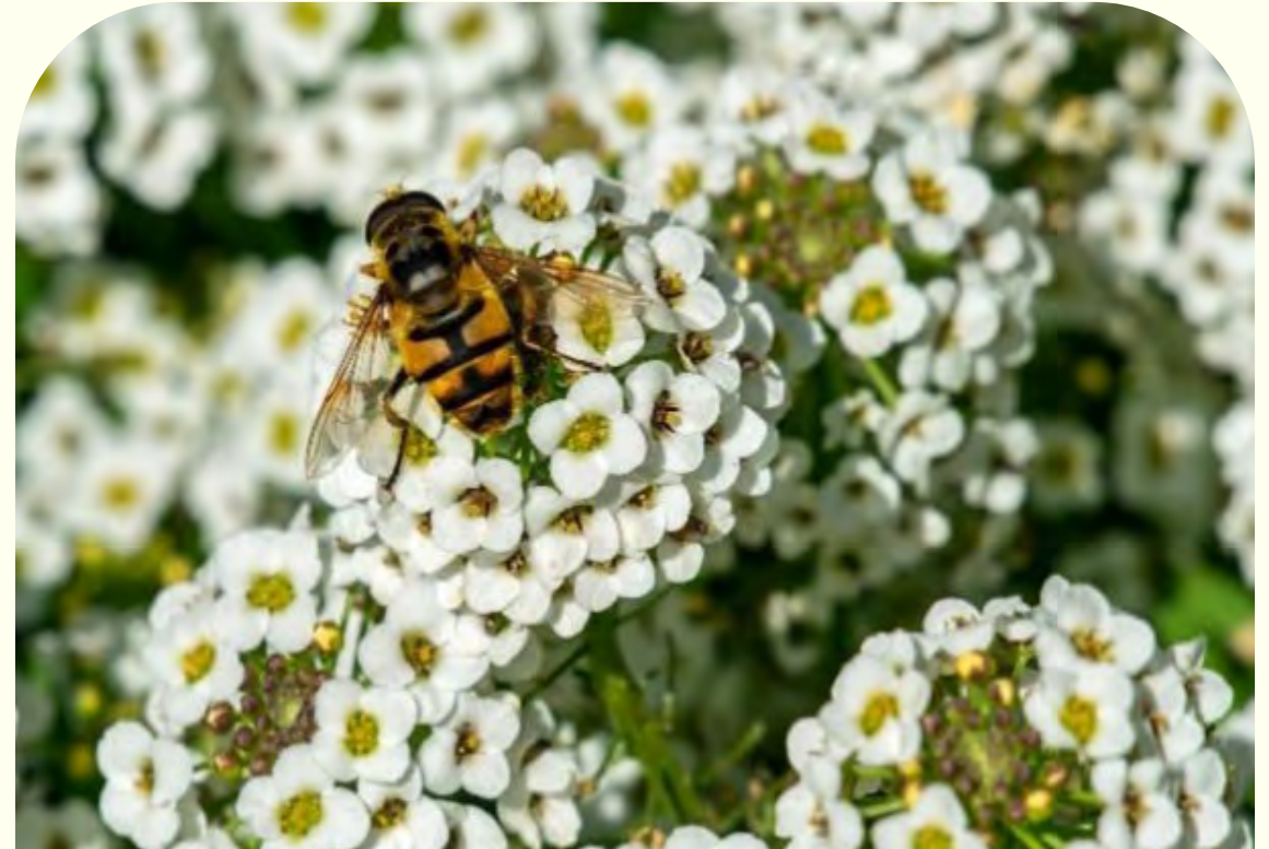
A Syrphid Fly landing on an alyssum flower.