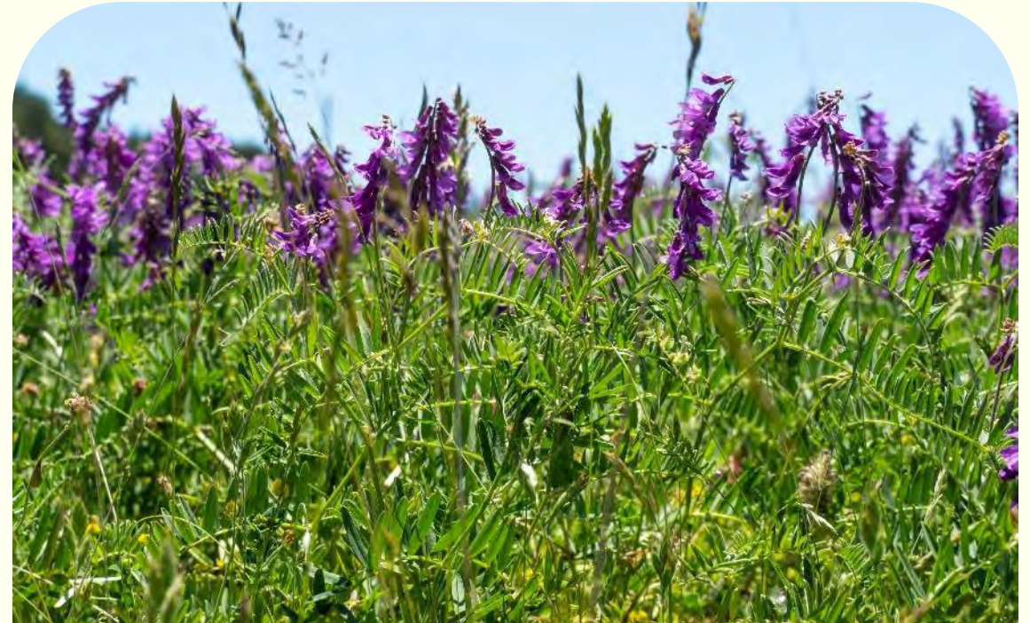
Vicia villosa , aka hairy vetch

A common cover crop mix grown in winter in California contains vetch, peas, bell beans, and oats. Summer cover crops include sorghum-sudangrass, cow peas, and buckwheat. Most summer cover crops require irrigation. Legumes in cover crops produce more nitrogen with the addition of Rhizobium bacteria inoculant. Ask seed providers for options.